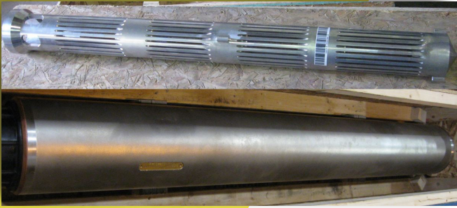
Downhole filter assembly